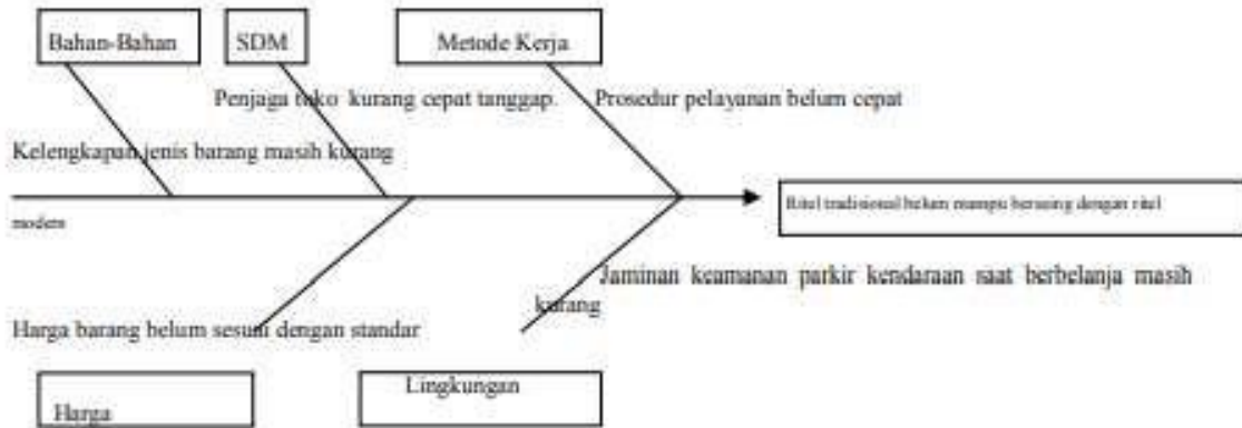
Figure 3. Fish Bond Diagram