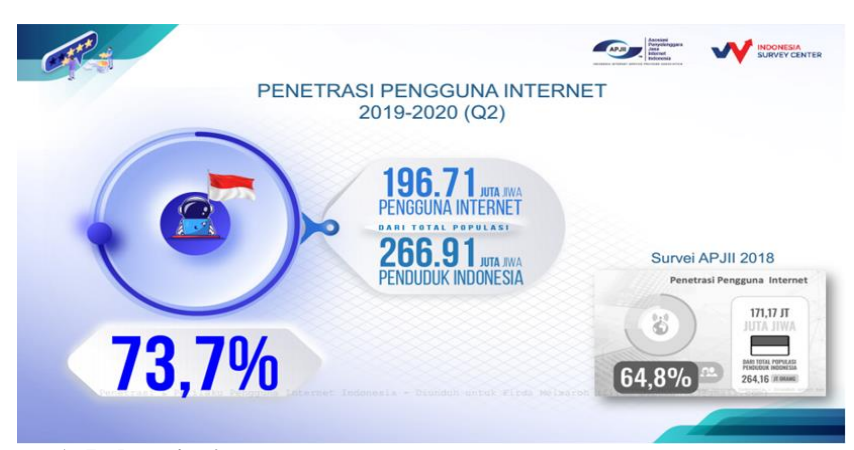
Figure 1: Indonesian's Internet Users

EPM as a technology literate company, continuously strives to obtain optimal business benefits. EPM has already established three distribution center in Jakarta, Surabaya and Cikarang, 48 branch offices and 28 subsidiary, also 25 sales offices throughout Indonesia. EPM always makes challenges into opportunities in order to realize vision and mission of EPM. So, EPM sees the wide open opportunity of increasing internet user penetration in Indonesia through the explanation in the following picture.